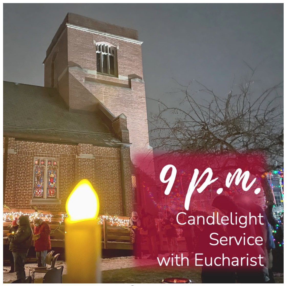
December 24, 2022

Saint Paul's Episcopal Church 39 E Central Street | Natick, MA 01760 stpaulsnatick.org