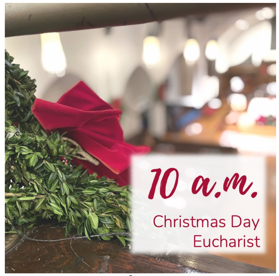
December 25, 2022

Saint Paul's Episcopal Church 39 E Central Street | Natick, MA 01760 stpaulsnatick.org